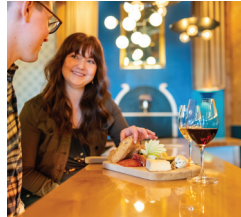
NEW FLAVOR: Brasserie Porte Rouge