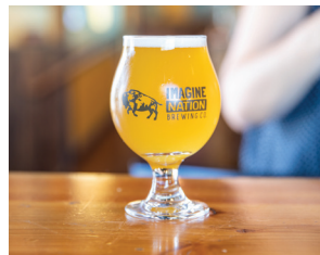
📍 IMAGINE NATION BREWING COMPANY

1151 W Broadway St 406.926.1251 imagenationbrewing.com