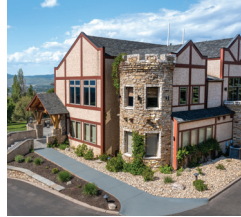
OLD FAVORITE: The Keep