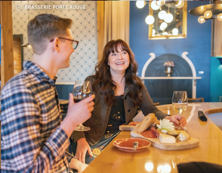
BRASSERIE PORTE ROUGE