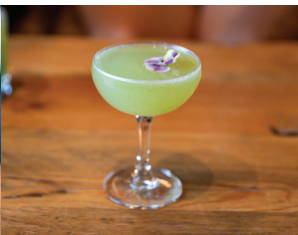
📍 MONTGOMERY DISTILLERY

501 N California St 406.540.4477 westerncider.com