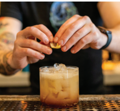
NEW FLAVOR: Bar Plata