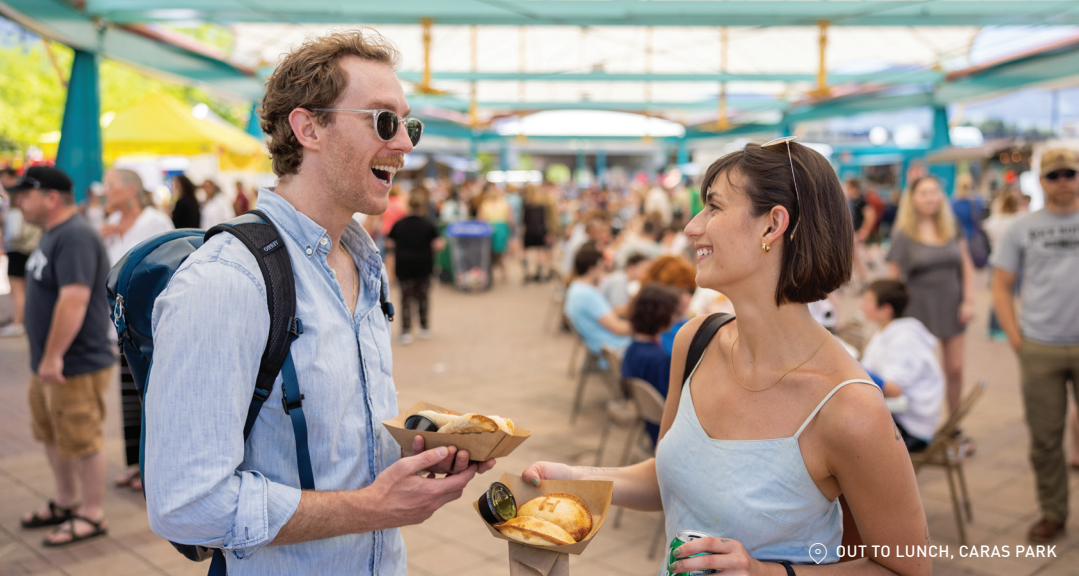
OUT TO LUNCH, CARAS PARK