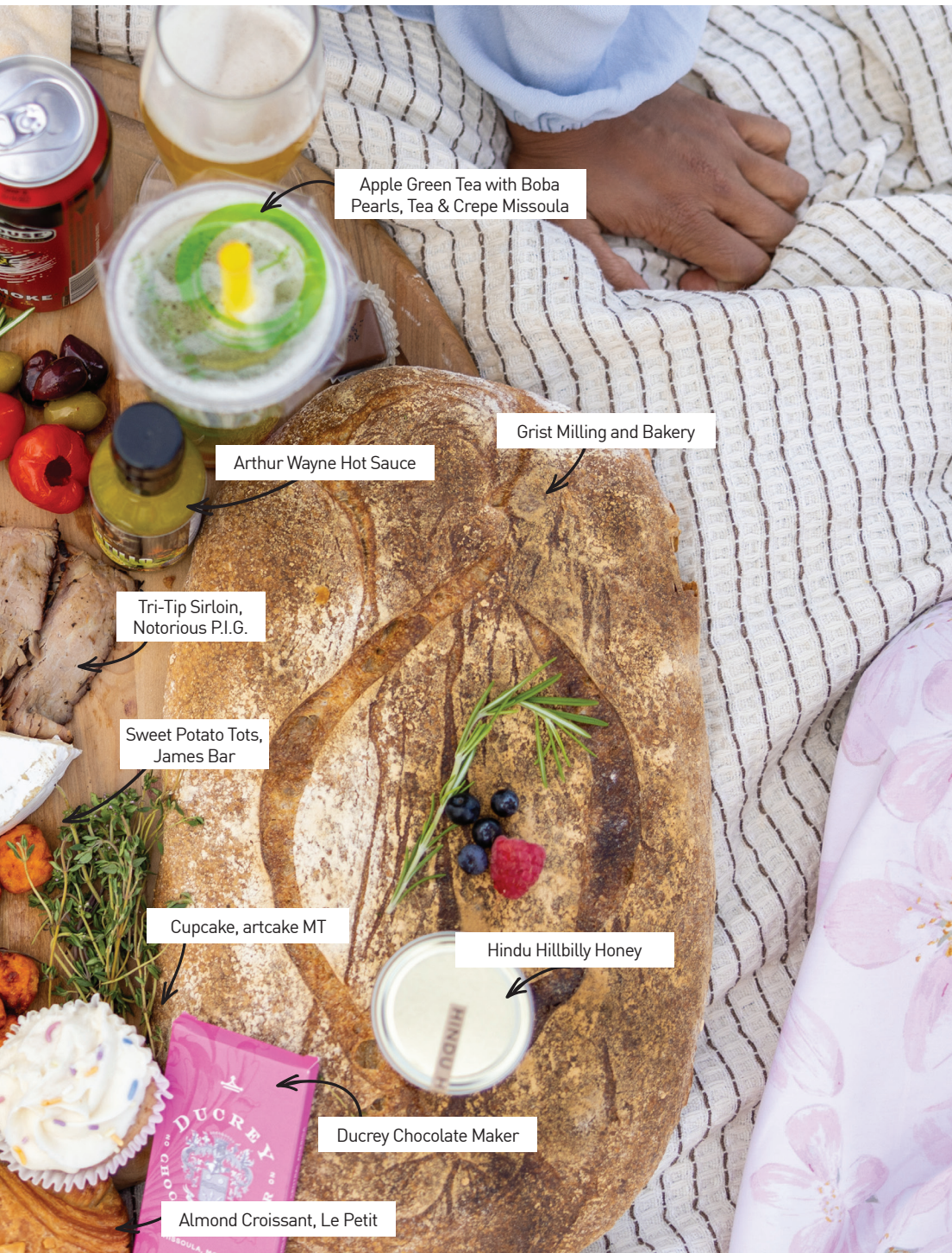
Apple Green Tea with Boba Pearls, Tea & Crepe Missoula