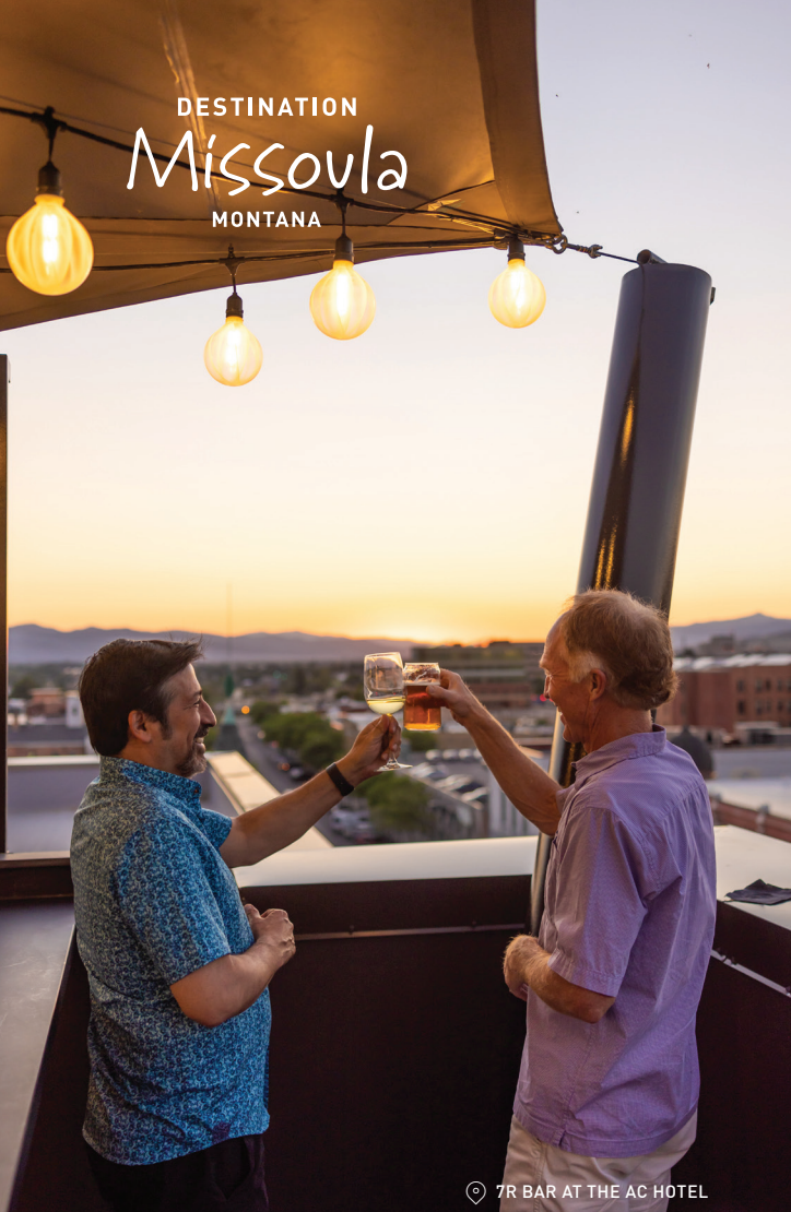
7R BAR AT THE AC HOTEL