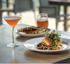
OLD FAVORITE: FINN