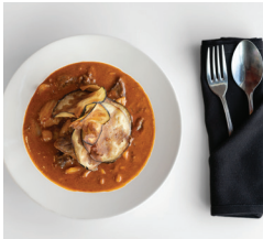
NEW FLAVOR: Rice Fine Thai Cuisine