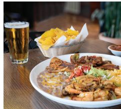
OLD FAVORITE: El Cazador