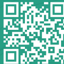
◎ CIAO MAMBO

Missoula’s dining scene is always evolving—find the latest information on restaurants, bars, breweries and more by visiting our website.