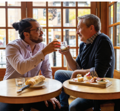
OLD FAVORITE: Plonk