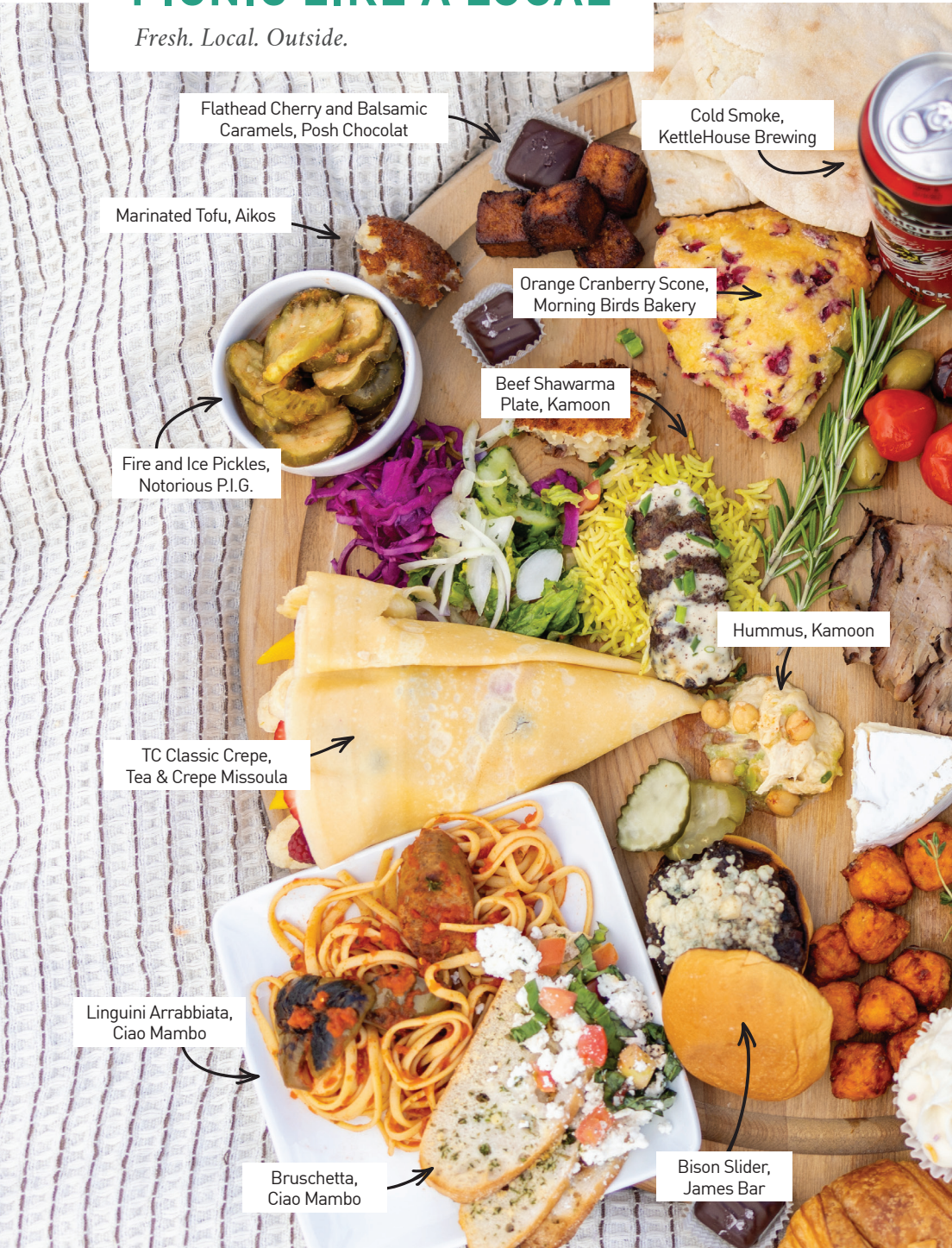
Flathead Cherry and Balsamic Caramels, Posh Chocolat