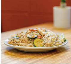
OLD FAVORITE: Pagoda Chinese Food