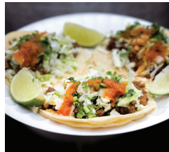
NEW FLAVOR: Mexican Moose