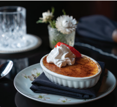
NEW FLAVOR: Boxcar Bistro